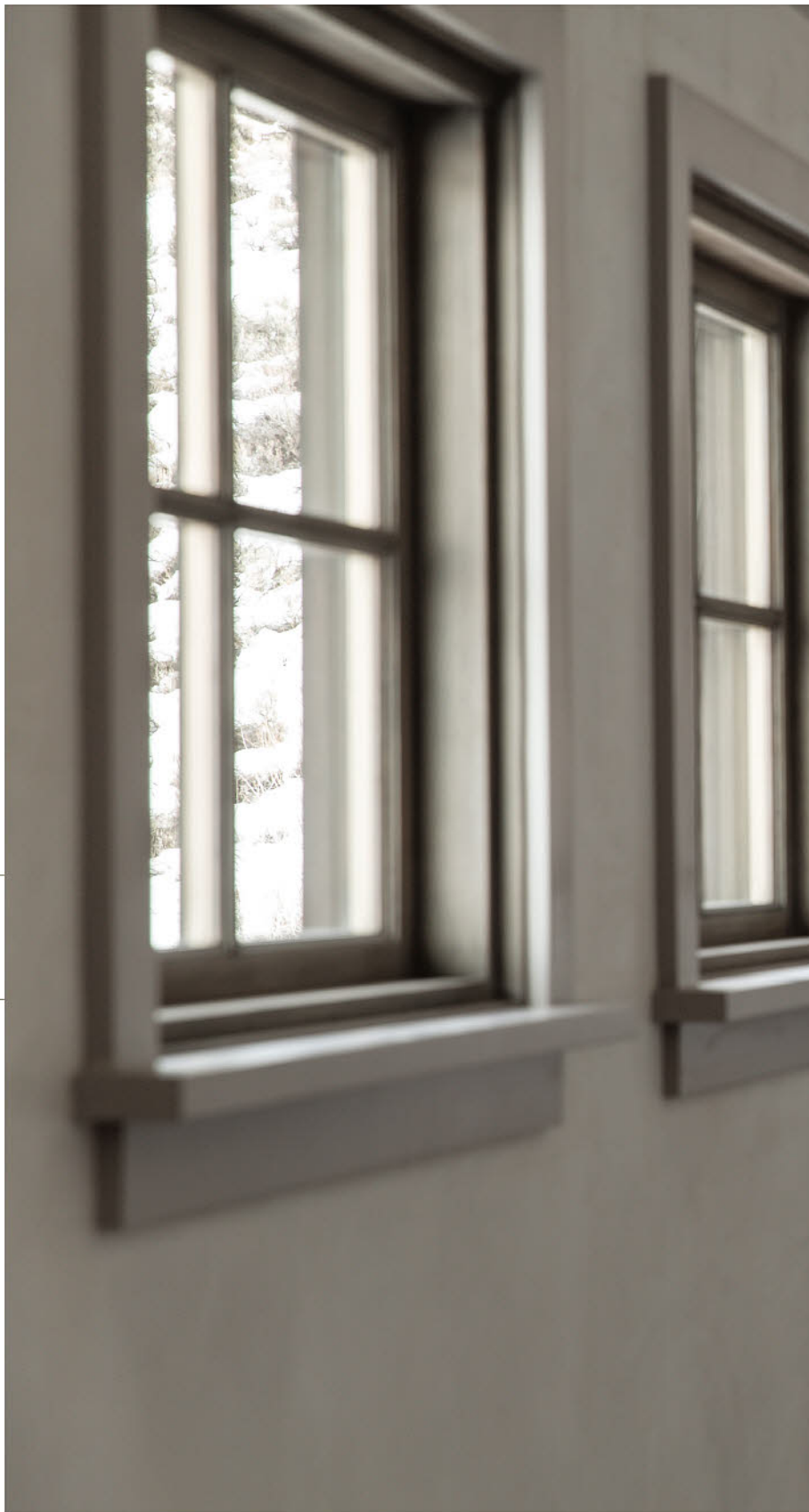
Above: Light floods the hall leading to a series of rustic barn doors.