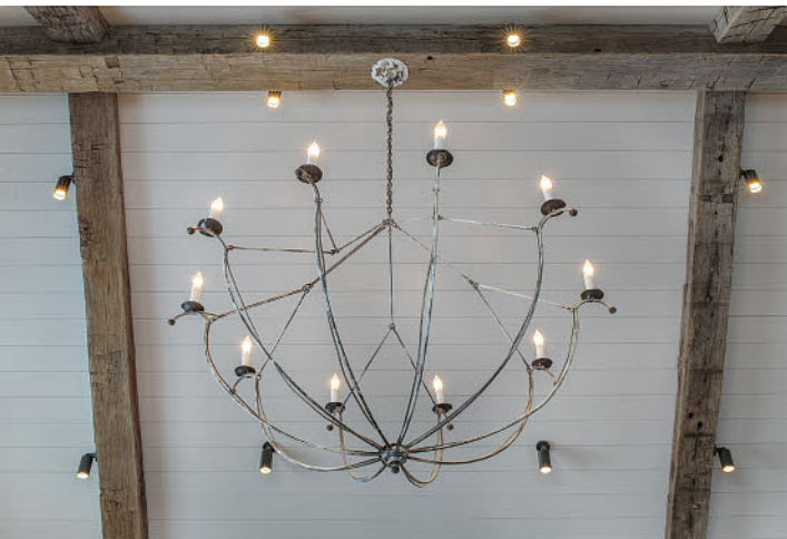
Above: A dramatic chandelier accents the rough-hewn beams and farmhouse white painted wood in the kitchen.