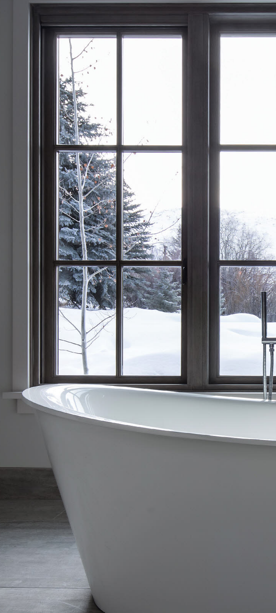
This page: The ultimate bath graces the first floor master suite.

While every room in the home exudes a welcoming appeal, the real focal point is the extraordinary view of Bald Mountain, captured by a magnificent picture window in the main living area of the house. The homeowners spent years scouring the Valley for the ideal location before finally setting on this private neighborhood close to town. The location of the